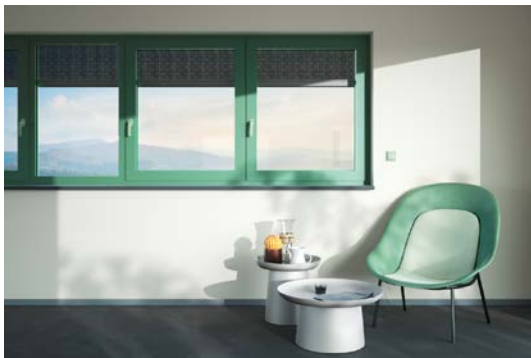
[Residential building_Le Corbusier_window_lateral]

Be they striking or subdued, the Le Corbusier colours can be combined harmoniously to make windows, roller shutters, etc. an eye-catching element of any property.