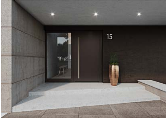
[Architect-designed_house_Le Corbusier_front door_surround exterior]

The heroal Les Couleurs® Le Corbusier front door combines top materials, excellent functionality and maximum flexibility with the distinctive Le Corbusier colour spectrum.