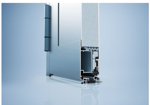
[heroal D 72 PF EM 60 mm]

Double-sided sash-concealing: new door sash profile heroal D 72 PF EM bs