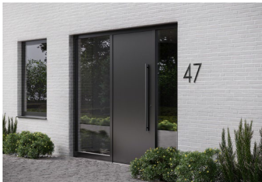
[heroal D 72 PF EM]

The heroal D 72 PF EM front door system is based on the system logic of the tried and tested heroal D 72 front door system, and stands out for its easy and efficient fabrication.