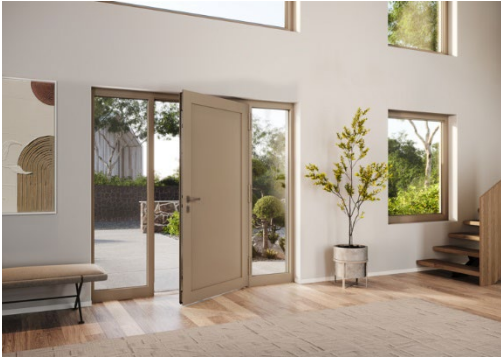
[heroal D 72 PF EM 60 mm Haustuer innen]