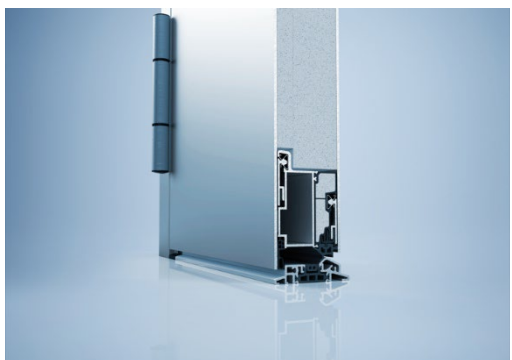
[heroal D 72 PF EM bs]

The heroal D 72 PF EM front door system is based on the system logic of the tried and tested heroal D 72 front door system, and stands out for its easy and efficient fabrication.