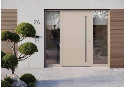
[heroal D 72 PF EM Haustür]

The heroal D 72 PF EM door sash profiles reduce the work steps and material required for door production. The system portfolio has now been expanded with the heroal D 72 PF EM bs casement-enclosing door infill panel on both sides.