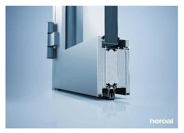
[heroal D 93 FP]

The heroal D 72 PF EM door system impresses with exceptional efficiency in production and has now been expanded with a casement-enclosing variant on both sides.