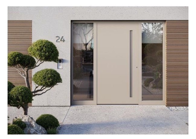
[heroal D 72 PF EM Haustür]

The heroal D 72 PF EM door system impresses with exceptional efficiency in production and has now been expanded with a casement-enclosing variant on both sides.