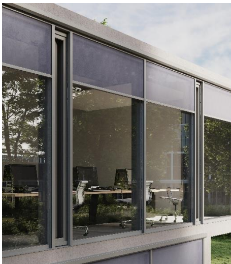
[heroal VS Z CS Ambiente]

Thanks to the option of integrating solar motors, heroal roller shutter systems can be operated without a separate power supply, making them particularly energy-efficient.